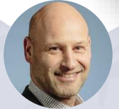
Joseph Lubin Co-Founder & CEO

MetaMask is a software-based cryptocurrency wallet used to interact with the Ethereum blockchain and has over 30M active users. Users can access their Ethereum wallet through a browser extension or a mobile app what is very convenient. The company's revenues quadrupled from $52 million in 2019 to $218 million in 2021. Everyone thinks ConsenSys is just MetaMask, but the company manages six other leading projects in the market, including Codefi, Diligence Audit, Infura Web3, Quorum Blockchain, Truffle, ConsenSys NFT. It's also important to notice that Joseph Lubin CEO ConsenSys is the co-founder of the second most capitalized cryptocurrency ETH - Ethereum together with Vitalik Buterin.